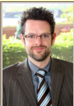
Dr. Jeffrey Karp

The cultured cells include mesenchymal stem cells, which can form fat cells, cartilage, bone, tendon and ligaments, muscle cells, and even nerve cells. When injected into the bloodstream of patients, mesenchymal stem cells can home to the site of an injury and replace damaged tissue. But just a fraction of the mesenchymal stem cells currently reach their target in clinical trials. One problem is that the cells lose their ability to roll along the walls of blood vessels when they grow and divide in a dish. The new technique should prevent cultured cells from drifting passively through the bloodstream, potentially enabling more of them to migrate out of the vessels into the surrounding tissue.